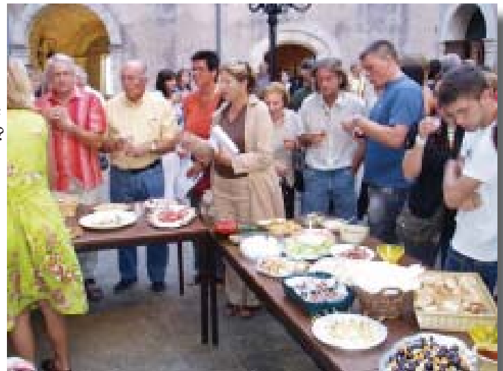
This is the "Eating and Drinking" part of the art exhibition in our Château

Finally, we are very glad that it has rained in Iowa. We are still waiting for ours. Our very best to you all. Take care. RW.