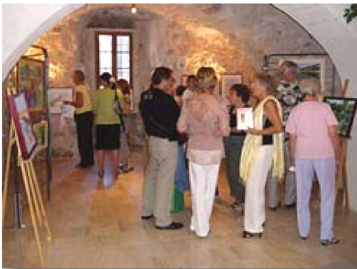
A part of the art exhibition in our Château