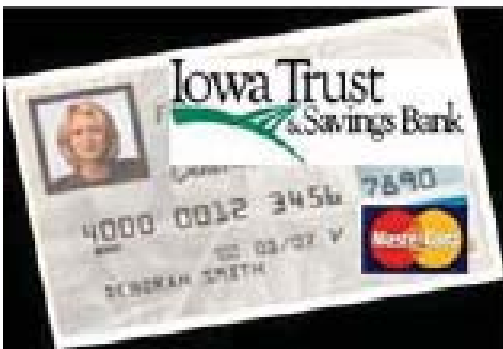
PHOTO DEBIT CARDS