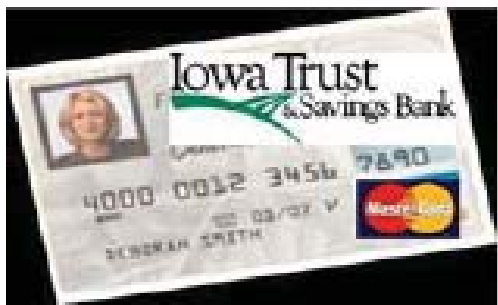
PHOTO DEBIT CARDS