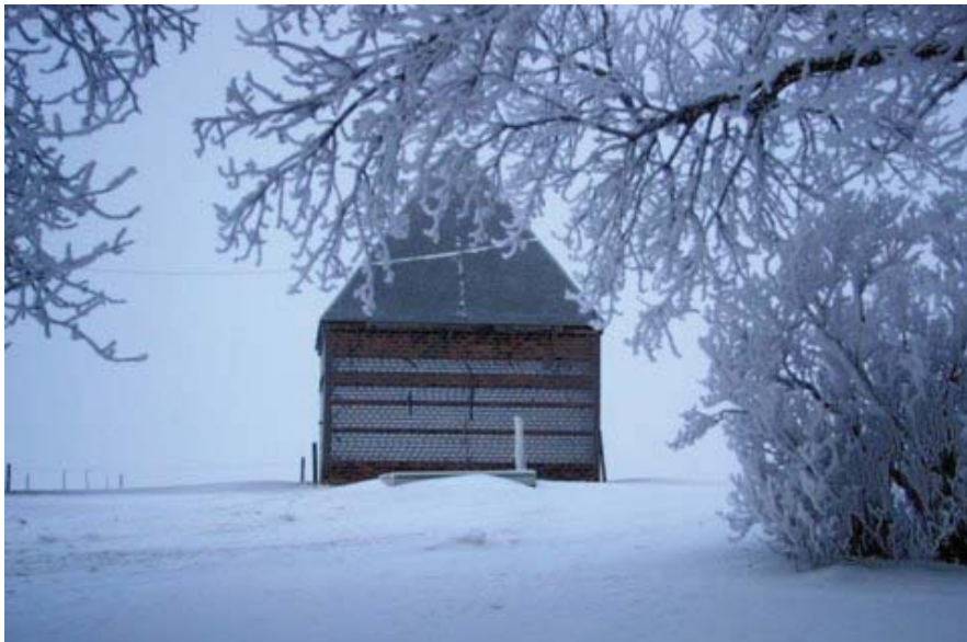
Morning Frost

My, my, shout some of us in the sappy, old guard: How could this happen? Alas, we're thinking with our hearts instead of our noggins. Too heavy on the nostalgia and leaning into a strong wind while failing to wake up and smell the ammonia. When I sauntered down those hallowed halls of Laurens High for the last time as a graduating senior in May 1963, I figured the place would be home turf for the Elks forever. Survival (via consolidation) -- driven by changing demographics and shrinking enrollment -- wasn't even a fleeting notion. Then, in 1976, when it became Laurens-Marathon, home of the Chargers (instead of the Elks), and