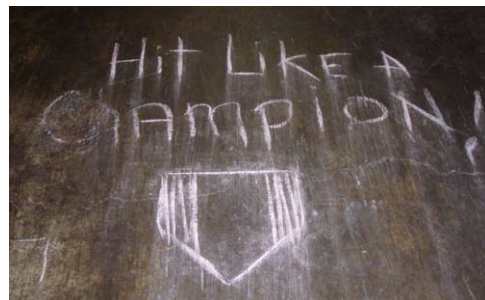
Hit Like A Champion!