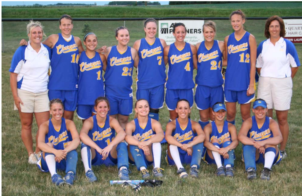
2007 Twin Lakes Conference Champions