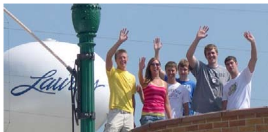
Biggest Little Paper In Town!