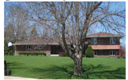
315 E Garfield – 4 bdrms, 3.5 ba, formal dining and living rooms, family room, tri-level, patio with large lot