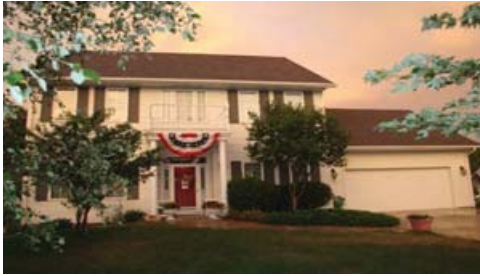
433 E Garfield – 3 bdrms, 2.5 ba full finished basement, open staircase formal living and dining room, barn and fencing incd, 1.53 acres

NOW is the time to buy – We have something for Everyone