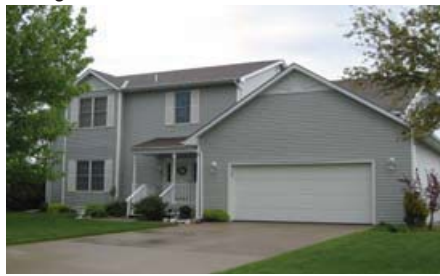
413 E Garfield – 4 bdrms, 2.5 ba formal dining and living room, fam rm, heated tile flooring, 2 nd floor laundry, fenced back yard, .8 acres