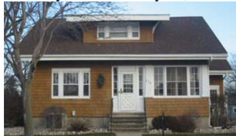
224 W Section Ln Rd -4 bdrms 2 baths, family room, attach garage historic home