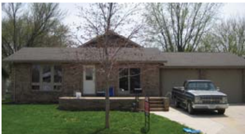
520 Allen – 3 bdrms, 2 baths, large living room, 2 car attached garage all electric