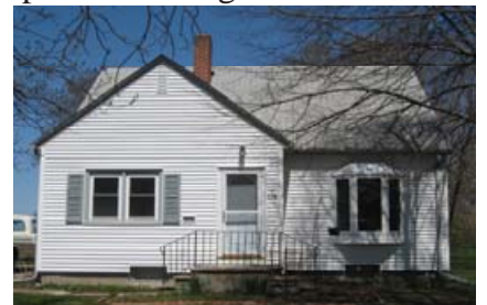
114 W Garfield - 3 bedrooms new kitchen and living room close to school

317 Oak Street – 3 bdrms, finished basement