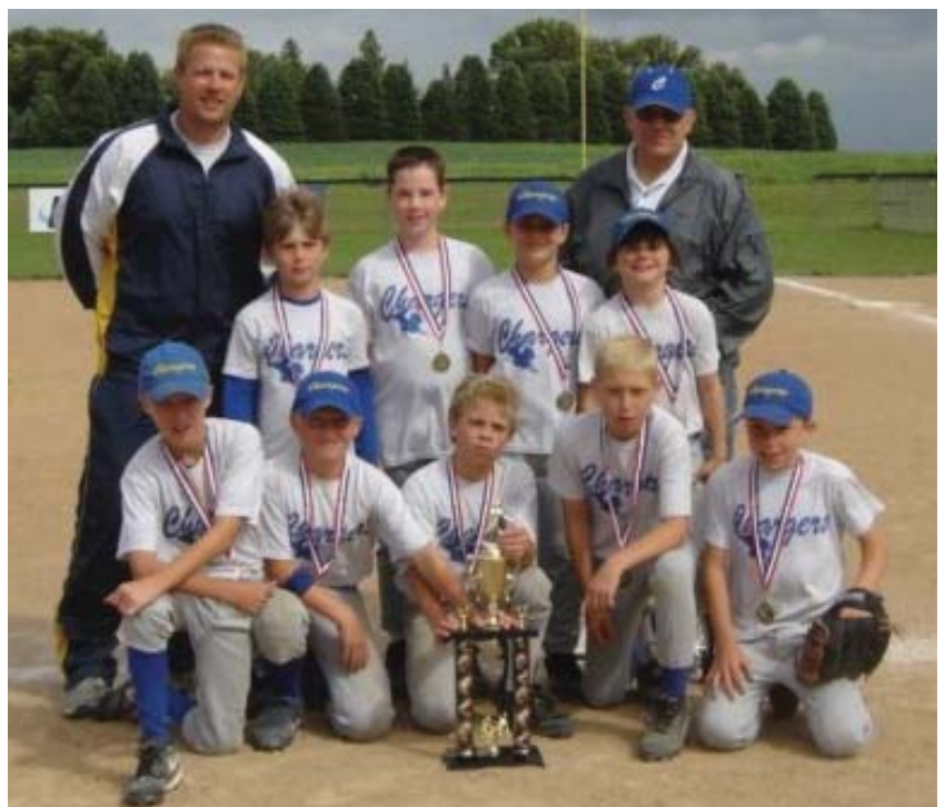
Biggest Little Paper In Town!