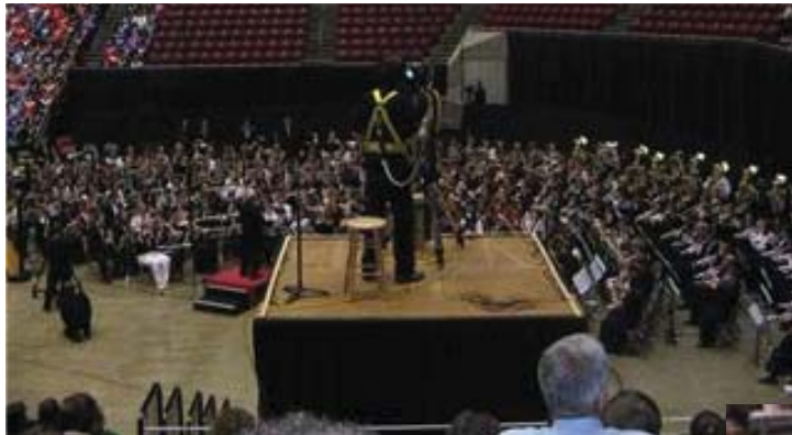
The band at the concert being taped by IPTV

West Hwy 10 Laurens, Iowa (712) 841-2287