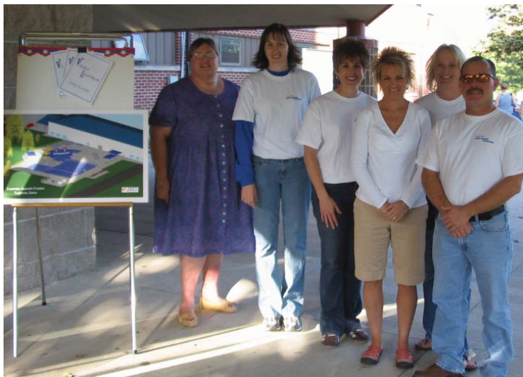
Biggest Little Paper In Town!