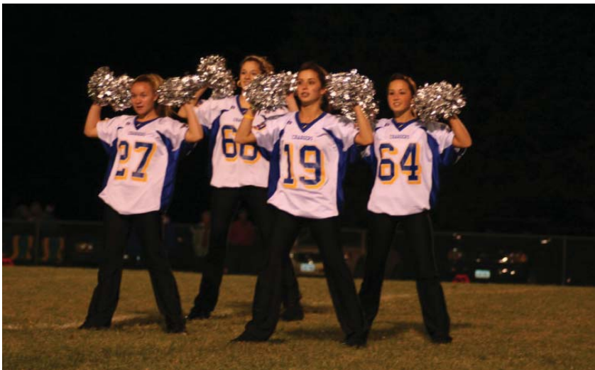
Biggest Little Paper In Town!