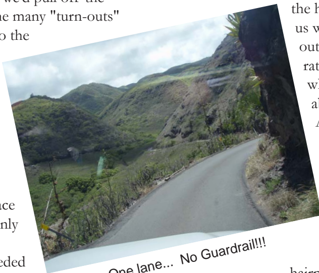
One lane... No Guardrail!!!

The travel book indicated that we'd encounter a narrow twisting road ahead and the world's sharpest hairpin turn—so tight that there was no possible way to photograph it. That's because it is at the top of a steep hill at the edge of a cliff! We made it down one side of the ONE LANE road with no problem, made a 180 at the bottom of the gulch and headed up the other side with the hairpin in sight. About a quarter of the way up, we noticed two cars stopped on the hill ahead of us with drivers outside with a rather "now what" look about them. As we inched toward them, we noticed two more cars trying to come down from the hairpin—also stopped with drivers outside pointing and waving. Immediately, Anita and I concluded that we were satisfied to have sampled only the best banana bread on the planet, backed down the hill far enough to find a small indentation in the hillside, spun the Jeep around and headed back to civilization.